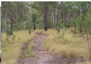
Start of walk to Mt Ninderry